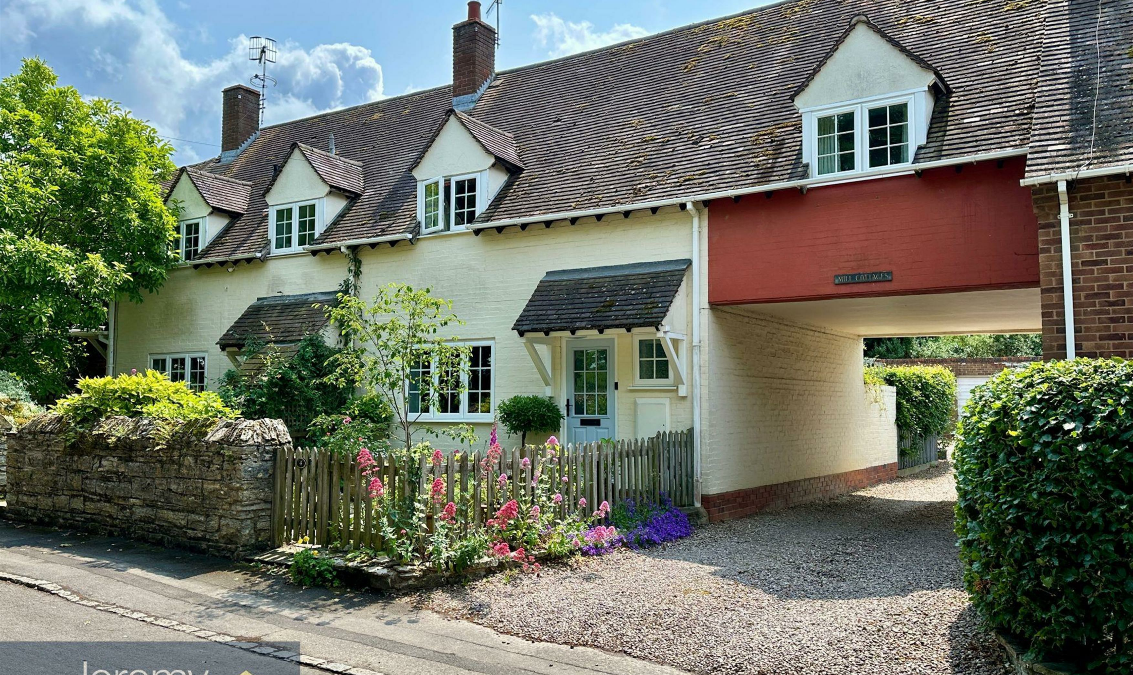
Mill Lane , Broom Alcester, B50 4HR